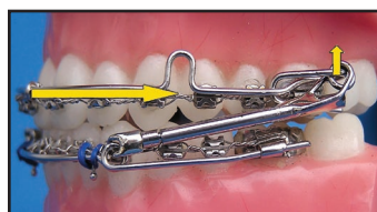
190 Integrated Herbst