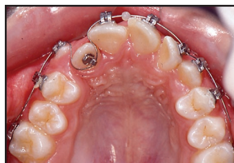
171 Retroclined Teeth